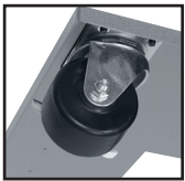
The base features 3" swivel casters