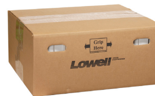
Available in multi-pack contractor cartons.