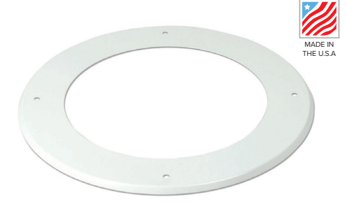
Lowell Retrofit trim ring #ES-6-RTR.

for use with #ES-52T or ES-62T speaker steel with white finish