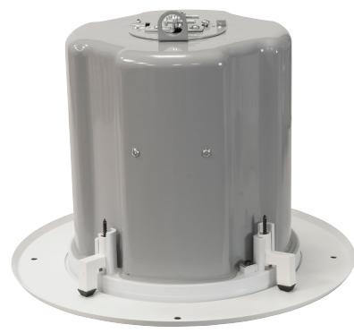
Retrofit trim ring mounted to Lowell speaker #ES-62T.