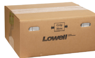
Available in multi-pack contractor cartons.