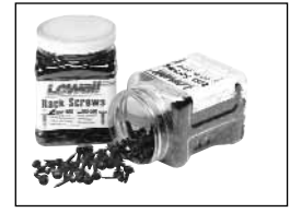
Hardware Order extra PilotPoint™ screws.

See also Lowell's complete section of AC power products including rackmount panels, strips, controllers, sequencers, filters and surge suppressors.