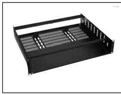
Shelves and Drawers