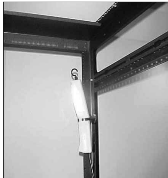
RL-1 (shown magnetically mounted in a rack)