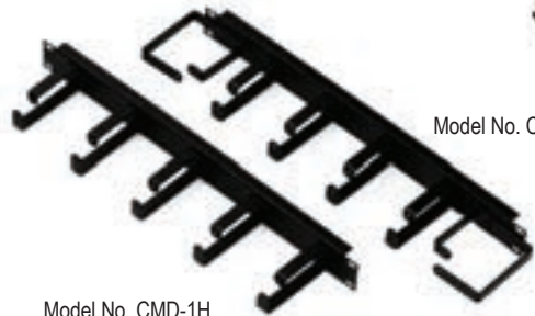
Model No. CMD-1HV