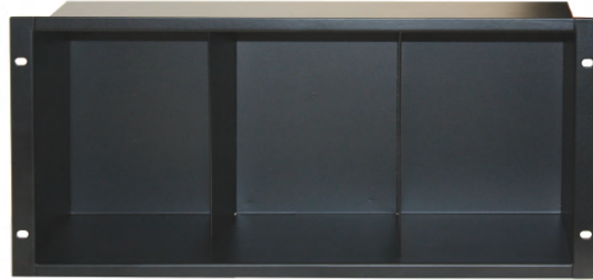
The MH5-DVD rackmount media holder will hold up to 40 jewel cases.