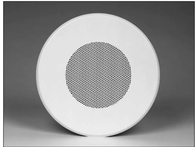
CS-8W Steel grille with torsion mount for visibly hardware-free appearance

Note: This grille is also used for installation of 8" speaker drivers. Please refer to the 8" speaker section for companion 8" speaker mounting accessories.