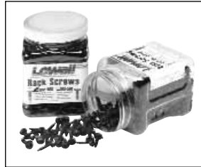
RSP-500 / RS-500 Jars

ALL screws have 5.1 hardness and include PilotPoint™ tip and captive washer!