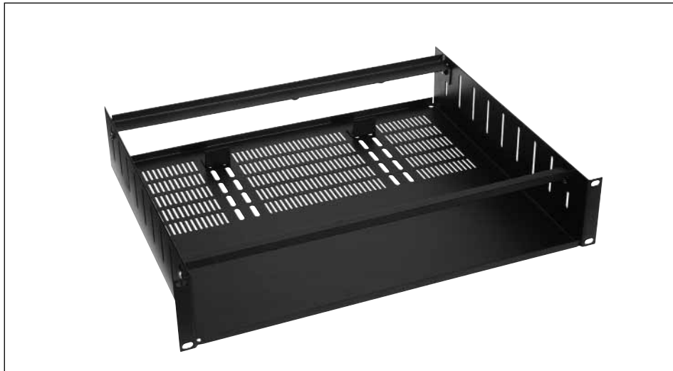
L10 Series (L10-315 shown)