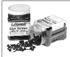
RSP-500 / RS-500 Jars

NEW RSR Robertson square head available!