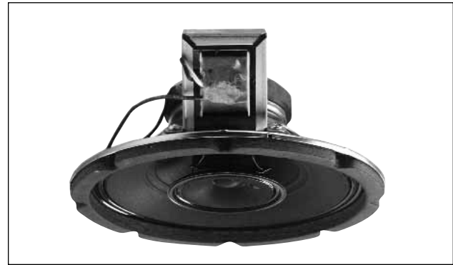
20 Watt Coaxial Speaker Assembly with 8W 70V Transformer (arrives factory mounted to one of three grilles below)

Companion backboxes and accessories for Lowell C Series speakers are itemized on pages 1 and 2 to facilitate installation in a variety of applications. Selection includes recessed protective and acoustic backboxes with companion tile bridge or channel rail options (if required for suspended installation) and a surface mount backbox (see chart below). Companion accessories are ordered separately.